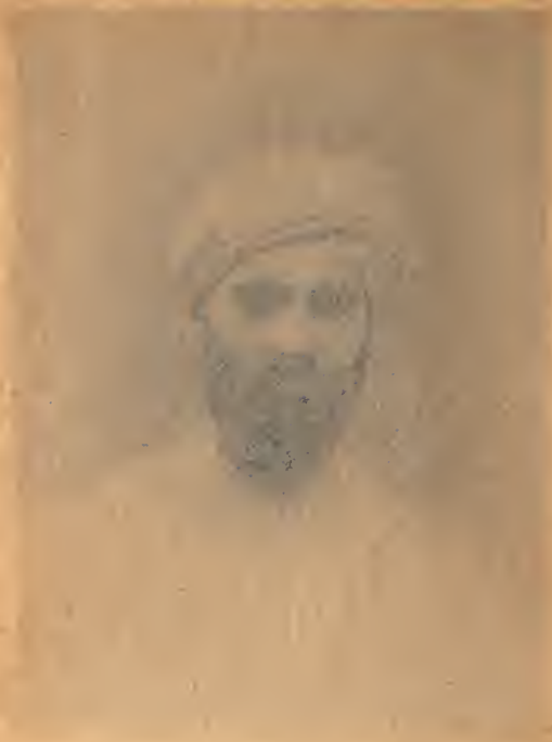
Portrait of [illegible name]