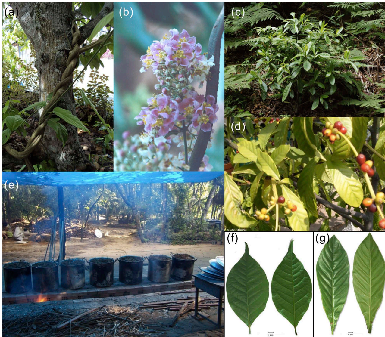
Figure 1. (a) B. caapi growing in front of a tree, (b) B. caapi flowers, (c) P. viridis shrub, (d) P. viridis leaves with fruits, (e) preparation of ayahuasca brew at a community in Alter do Chão, Pará, Brazil, in February 2010, (f) detail of B. caapi leaves, and (g) detail of P. viridis leaves.

a Please note that the Quechua term Ayahuasca ( aya = spirit, ancestor; and waska = vine) is largely employed, sometimes referring to B. caapi alone, sometimes referring to all forms of the preparation, including some that use only B. caapi .