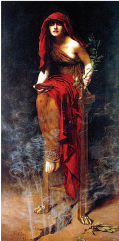
Fig. 1. Priestess of Delphi by John Collier (1891). Pythia is depicted in a trance state as she inhales vapors rising from the fissure underneath. This image is in the public domain.

likely that the sweet pneuma was ethylene, which transported the Oracle to her psychedelic states.