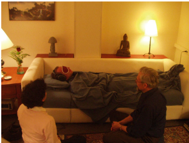
Fig. 17.1 The living room-like session room used in the Johns Hopkins psilocybin research studies. Comfortable, aesthetic environments free of unnecessary medical or research equipment, in combination with careful volunteer screening, volunteer preparation, and interpersonal support from two or more trained monitors, help to mini-

mize the probability of acute psychological distress during sessions. The use of eyeshades and headphones (through which supportive music is played) may contribute to safety by reducing distractions as well as social pressure to verbally interact with research personnel (reprinted from [47])